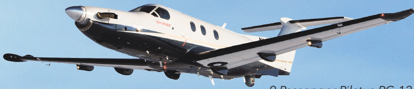
9 Passenger Pilatus PC-12

Payment in full by Cheque or Credit Card 30 days prior to scheduled trip with no refund within the 30 days period. A full refund of deposit prior to 120 days before scheduled trip.